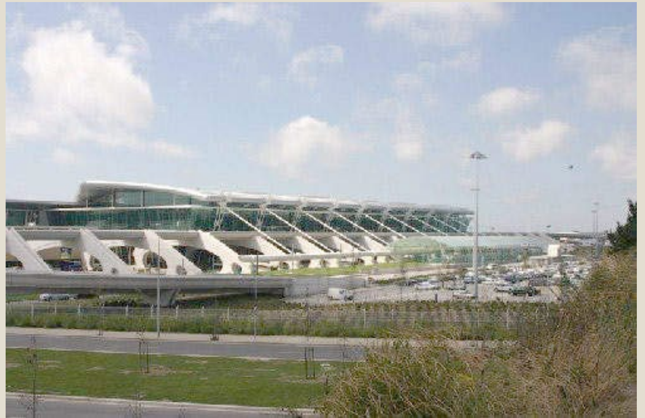
Porto International Airport